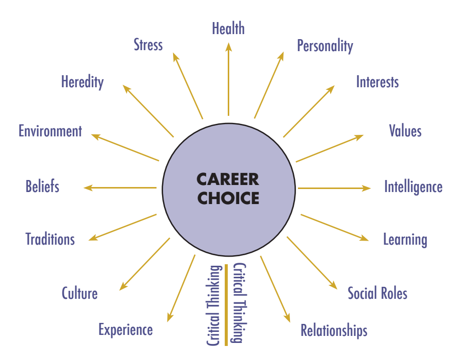
Figure 1.1 Factors in career choice.