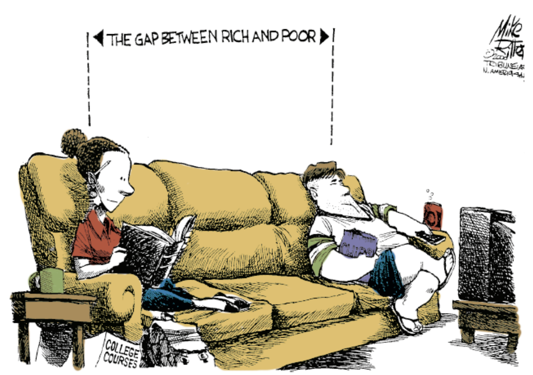
Mike Ritter © 2000 North America Syndicate

Notice that income rises with educational level. A person with a bachelor's degree earns almost twice as much as a high school graduate. Of course, these are average figures across the nation. Some individuals earn higher or lower salaries. People have assumed that you would certainly be rich if you were a millionaire. College won't make you an instant millionaire, but over a lifetime, you earn over a million dollars by having an associate's degree. People fantasize about winning the lottery. The reality is that the probability of winning the lottery is very low. In the long run, you have a better chance of improving your financial status by going to college.