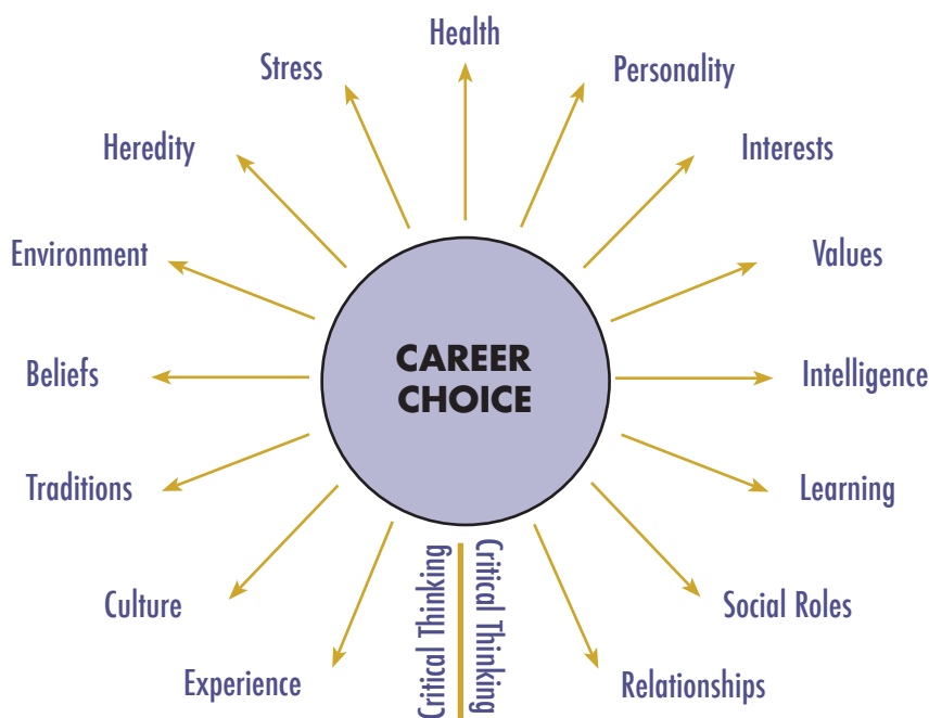
Figure 1.1 Factors in career choice.